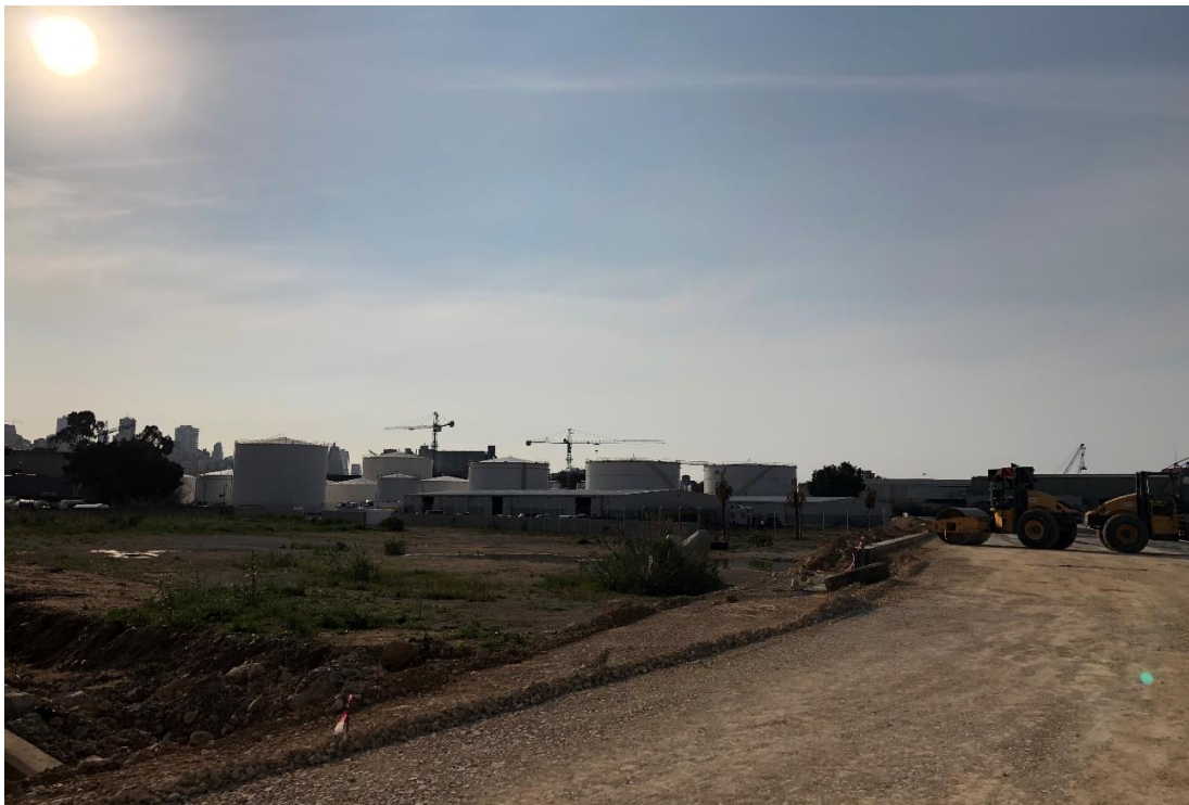
Figure 5-5: Fuel Storage Tanks near the Project Site