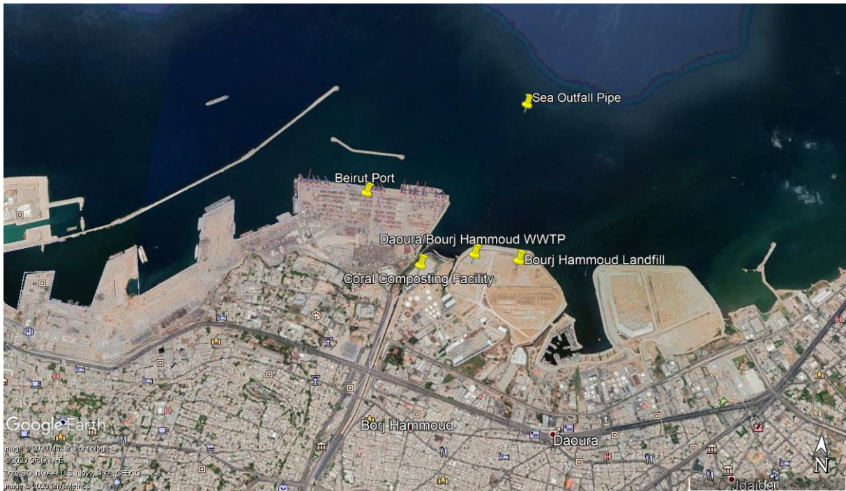
Figure 5-2: Proposed location of WWTP and surrounding facilities